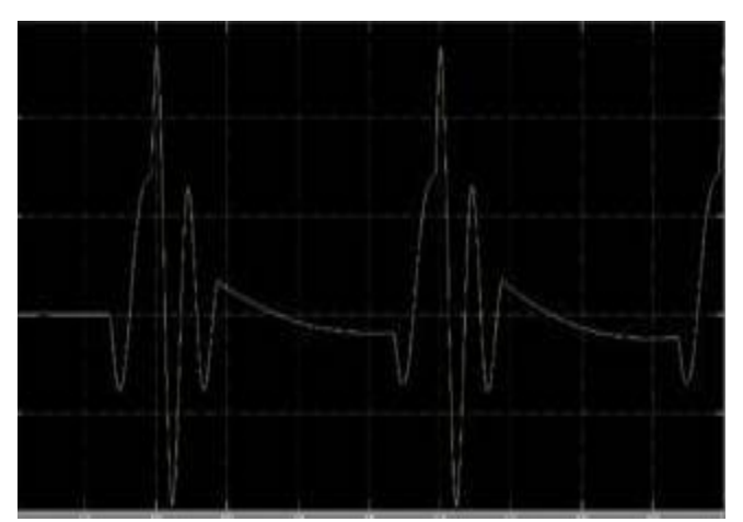
Figure 2: Simulink Waveform of Proposed System